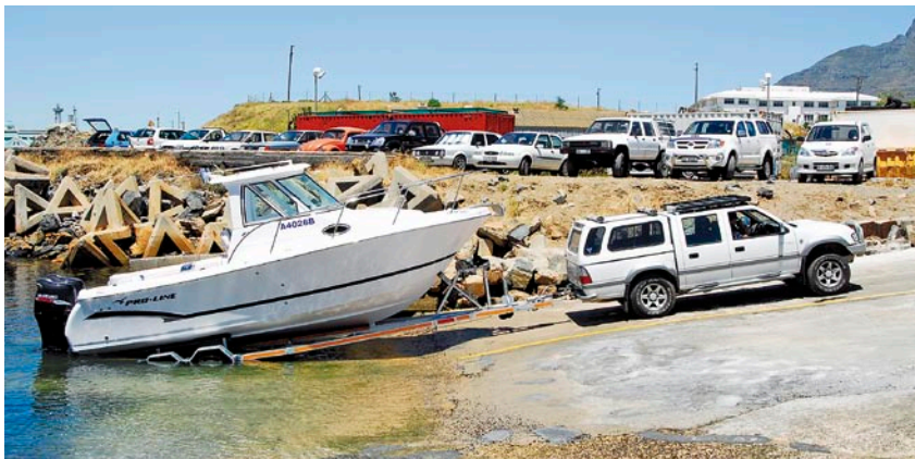
Even though she weighs a massive 2.25 tons, she didn't prove difficult to tow, launch or retrieve.