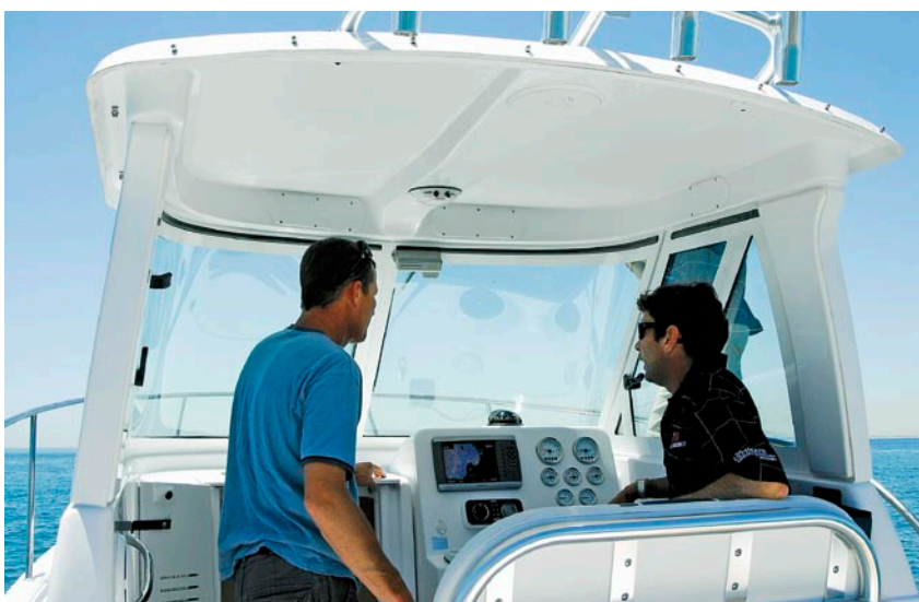
The 23 XP's sheltered pilothouse offers much-needed protection from notorious Cape conditions.