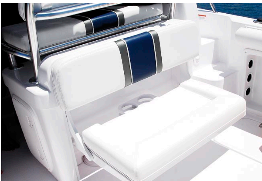
The boat's fold-out bench behind the pilot seat cleverly utilises space.