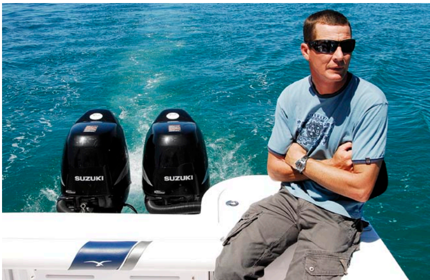
The twin 140 HP Suzuki's provided the 23 XP with a top speed of 38 knots at 6 300 rpm – quick for a hefty craft.